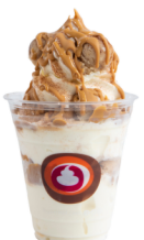
Snickerdoodle Cookie Butter