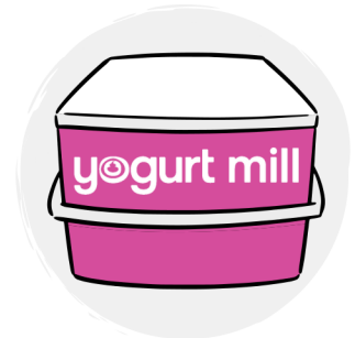
DROP OFF/ PICK UP

cateringandevents@yogurtmill.com • (209) 672-0586